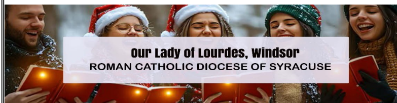
Our Lady of Lourdes, Windsor ROMAN CATHOLIC DIOCESE OF SYRACUSE