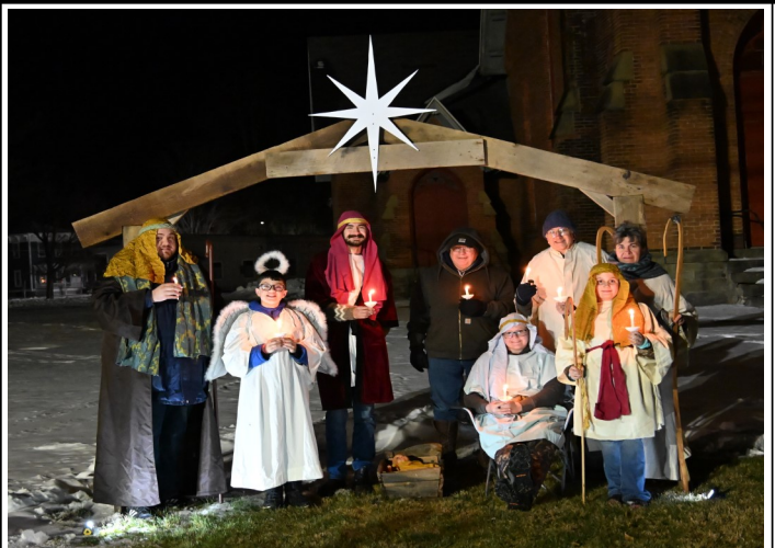
Deposit Council of Churches Live Nativity—12/6/25

We would like to help you with your needs at your time of loss. Please contact the office for assistance.