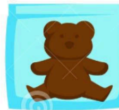
SEAL CLOTHES, BEDDING, AND PLUSH TOYS IN A PLASTIC BAG FOR TWO WEEKS