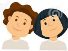
TOUCHING INFECTED HEAD