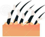
SORES AND SCABS