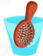
SOAK HAIR BRUSHES (90°)