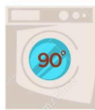
WASH CLOTHES AND BEDDING