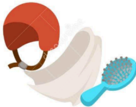
SHARING THE PERSONAL ITEMS