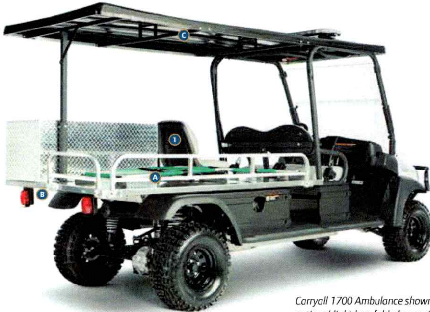
Carryall 1700 Ambulance shown with optional light bar, fold-down windshield and heavy-duty bumper.