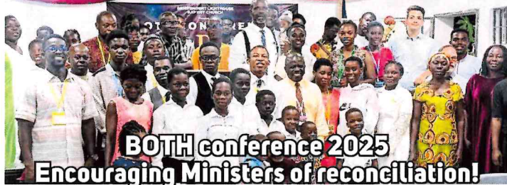
BOTH conference 2025 Encouraging Ministers of reconciliation!