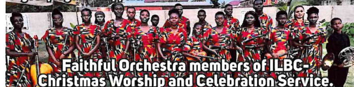
Faithful Orchestra members of ILBC- Christmas Worship and Celebration Service.