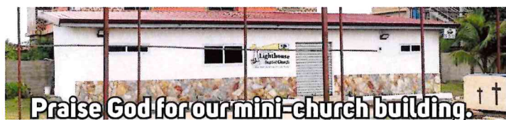
Praise God for our mini-church building.