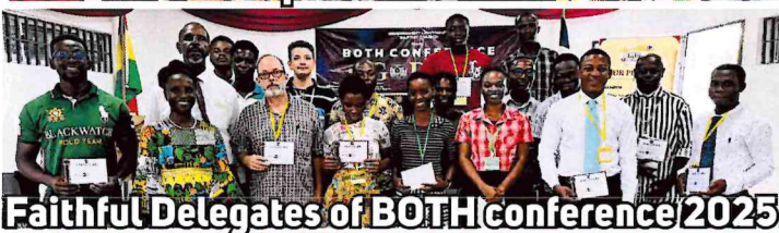
Faithful Delegates of BOTH conference 2025