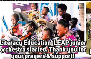
Literacy Education-LEAP junior orchestra started. Thank you for your prayers & support!