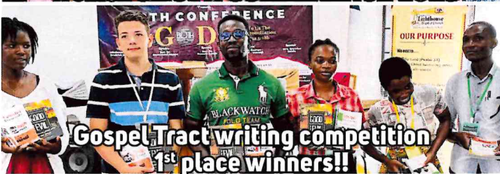
Gospel Tract writing competition 1st place winners!!