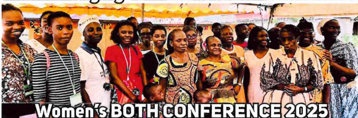
Women's BOTH CONFERENCE 2025