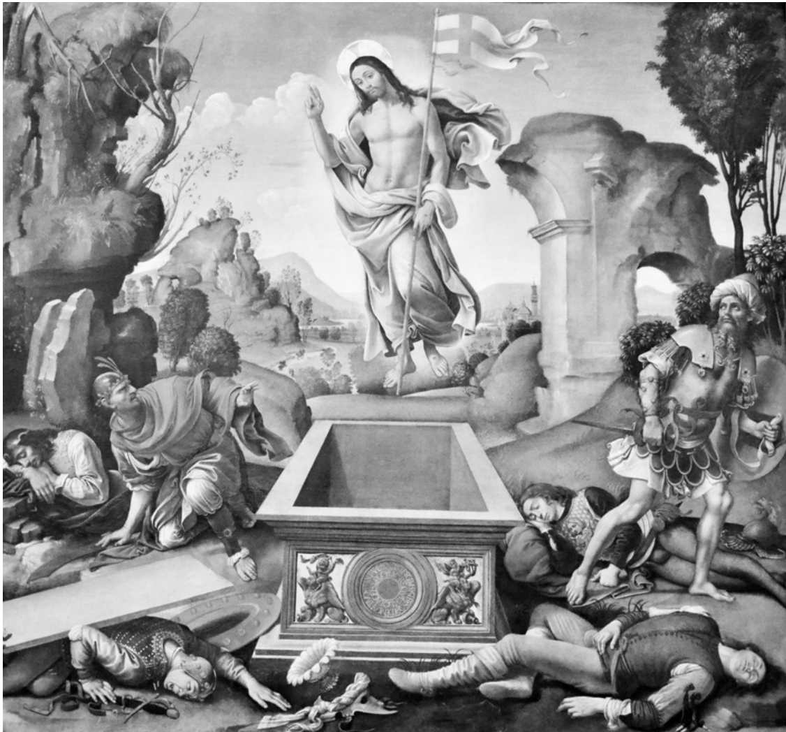
Resurrection of Christ Raffaellino del Garbo, 1500-1505