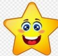
Rosie Yr 6