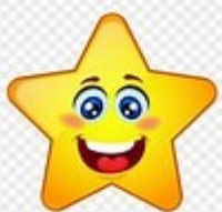
Brook Yr 3