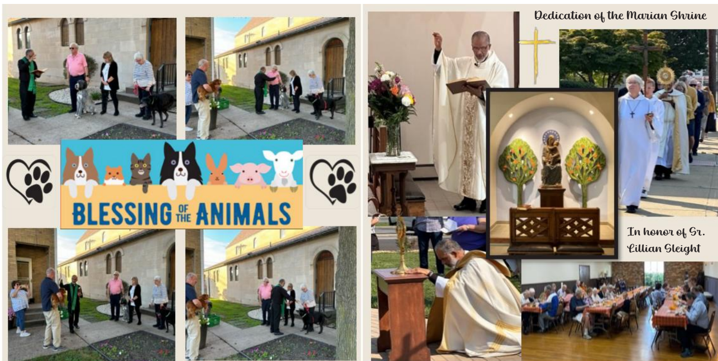
Dedication of the Marian Shrine