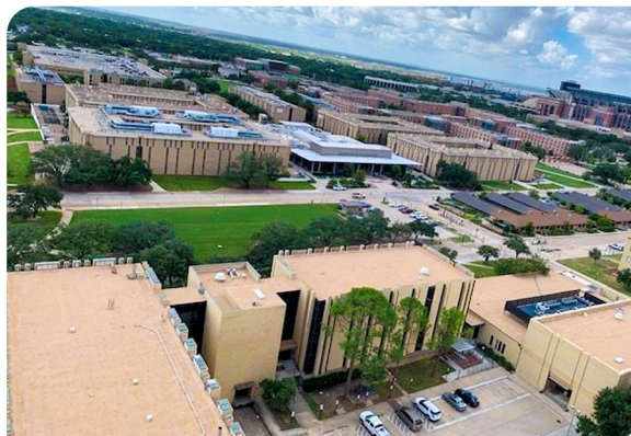
Teague Building – Texas A&M University