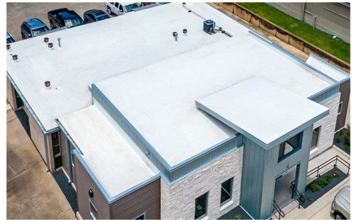
Wellman Insurance - Brenham, Texas