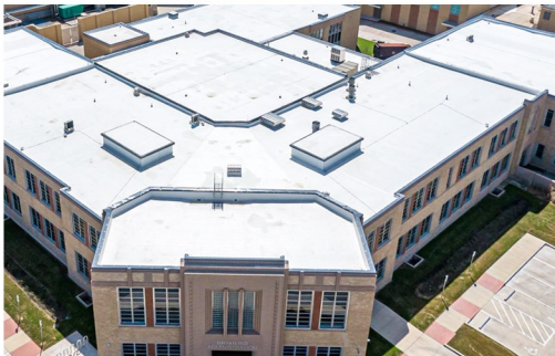
Bryan ISD - Bryan, Texas