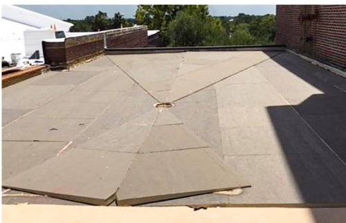
Davis Player Dev. Building - Texas A&M University