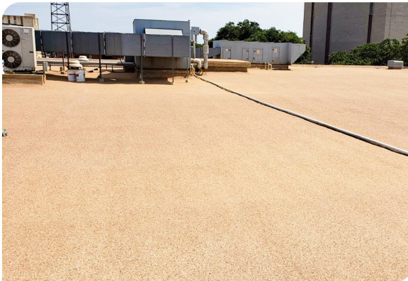
SR Collins – Prairie View A&M