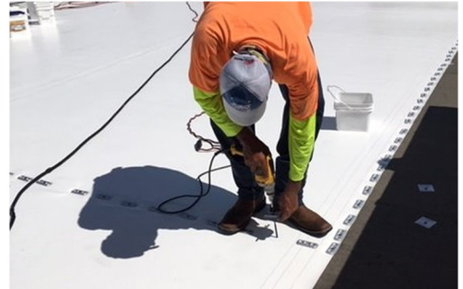
J.B. Coleman Library - Prairieview A&M