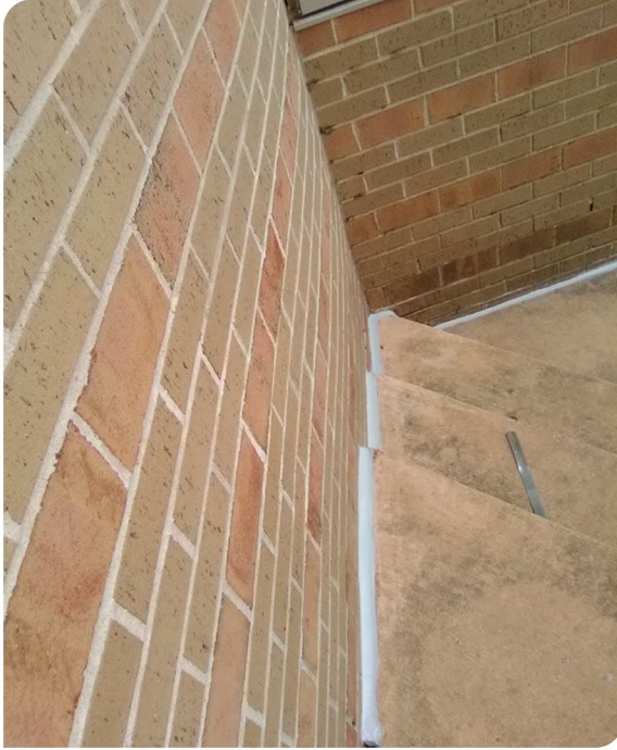
Mitchell Physics Building Texas A&M University

Many of our roof leak calls turn out to be common waterproofing issues that we can fix! We can seal your brick, expansion joints and windows- we can add a color or make your building look just the same!