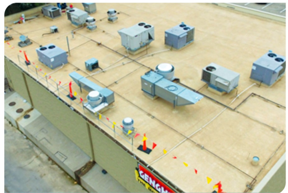
Genghis Grill – College Station