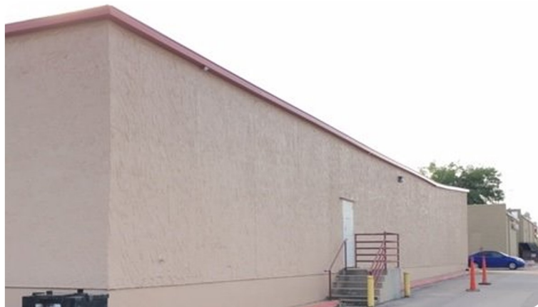
Village Center College Station, Texas