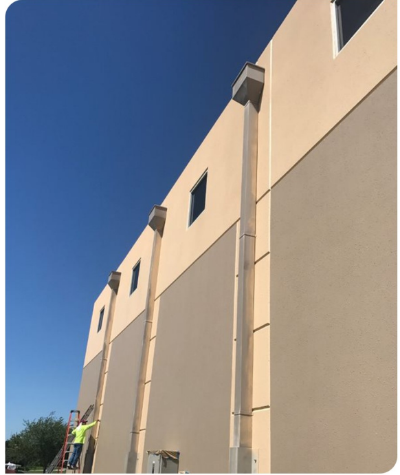
Boys & Girls Club Brenham, Texas