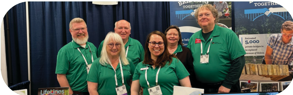
LDR Community of Practice Members at the 2025 NVOAD Conference

Join the Eastern Region Community of Practice Discussion hosted by LDR to connect with peers, exchange insights, and receive the latest updates from Churchwide Lutheran Disaster Response.