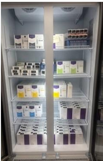
Injectable diabetic meds

In 2021, the clinic began to evaluate the number of patients who were reporting they did not fill their prescriptions from a previous visit (often 3 to 6 months prior) as we began to notice a lack of improvement in health outcomes of many patients even though they had access to medical evaluations. What we learned was twofold. Primarily: the cost of medication was not affordable for our low-income patients – they were forced to decide between basic necessities such as rent, food, utilities, clothing, etc. for their families. Secondly: many of our patients have a problem with reading or writing and basic understanding of how to take medications. In conjunction with our pharmacy team and medical providers – time is spent on how to properly take medications – especially as new medications are added to a patient regime as they pick up the prescription as needed. Another significant value of this program has been the access to Trulicity, which is a once-a-week injectable diabetic medication. This has been invaluable in improving health outcomes. Without this medication many of our diabetics would be required to take either multiple daily injections for one or more medications. This donated medication has a monthly cost on the retail shelf of $1600. Below are three basic pictures of our pharmacy which is located in a space within the clinic measuring 10x12 feet.