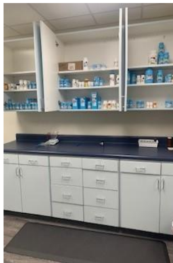
A few of the medication cabinets We have a total of 12