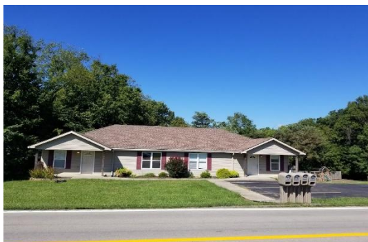
Bedford Apartments – 4 units