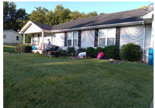
Smith Apartments – 4 units - LaGrange