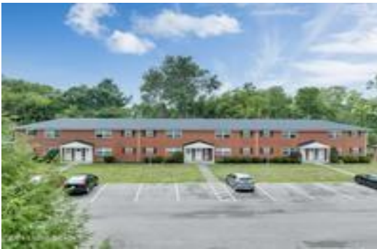
Anchor 110 – 12 units - LaGrange