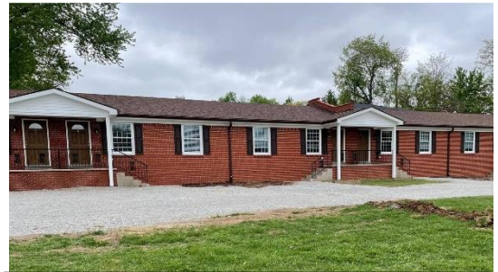
Anchor 120– 6 units - LaGrange