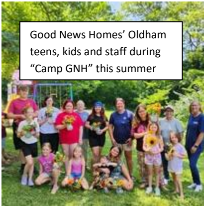
Good News Homes' Oldham teens, kids and staff during "Camp GNH" this summer

We currently have twenty-two transitional housing units in LaGrange and four in Bedford. A four-plex, three-bedroom, one bath unit is located on Highway 42 in Bedford. The same type four-plex is located on land donated by Harold and Sue Smith on 1 st Street in LaGrange. Both four-unit structures were built with the help of the Baptist Builders in 2000 and 2007. In 2021, Good News Homes purchased and remodeled a six-plex, two-bedroom, one bath property located at the corner of Anchor Avenue and Dawkins Road in LaGrange, and then in 2024, purchased a twelve-plex unit on Anchor Avenue in LaGrange. In November of this year, all units were remodeled and are fully occupied with families in crisis.