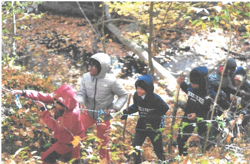
On the BATA Kids Adventure Trails using the roped steps!