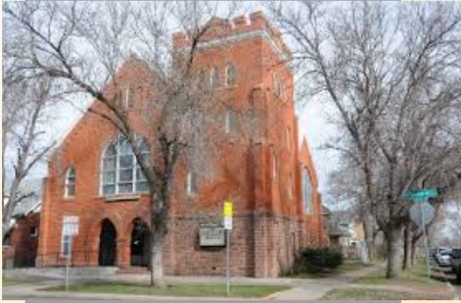
Pictured is the original Swedish Evangelical Lutheran Bethany Church in Denver at 32nd and Gilpin.

Our church was established in 1909 to serve the Northern European immigrants who worked in the smelters and ore processing facilities in Globeville.