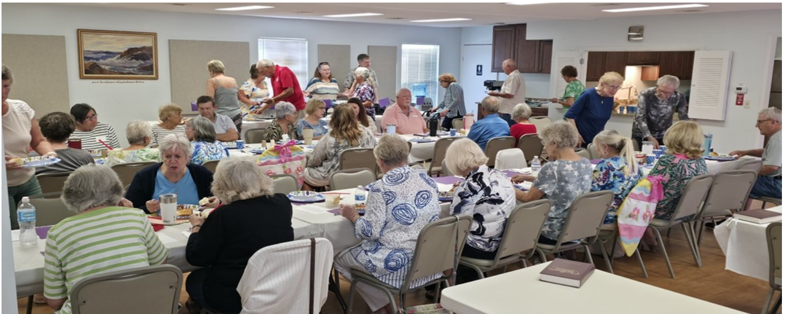
Meaningful Lenten Soup Suppers and Skits were enjoyed by so many!