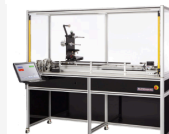
5000 SERIES AUTOMATIC WINDER