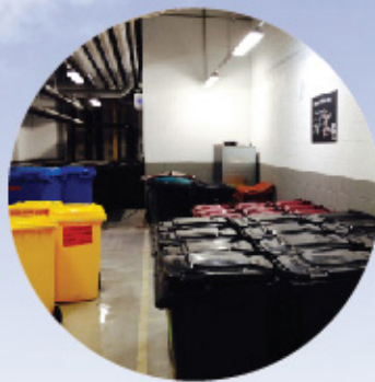
Bin Collection Areas