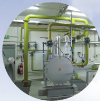
Waste Water Rooms

Ozone ( O_3 ) is a unique molecule that is 'unstable' by nature. This means that it naturally wants to break down to exist in the air as oxygen ( O_2 ). In a process called oxidation, the 3rd atom of ozone will readily break off and bond with unwanted, often odorous particles (viruses and bacteria). The benefit is two fold: oxidation neutralizes the unwanted particles and the two remaining atoms continue to exist in the air as oxygen O_2 . The result - the air is cleaner, fresher and odour free.