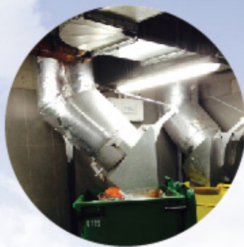
Hi-Rise Garbage Chutes