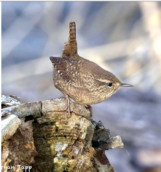
Winter Wren