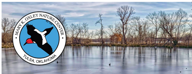
Winter Stillness | Bryan Tapp

Come out and walk this month at Oxley! You'll be surprised at all the signs of Winter you will see. Deer have filled out with their winter coats, and fawns have lost their spots. Armadillos abound and are surprisingly easy to spot, snuffling along in the underbrush. And all the different types of sparrows! Winter is the season when this plain, everyday bird becomes something special as we see many immigrant species that we don't normally spot.