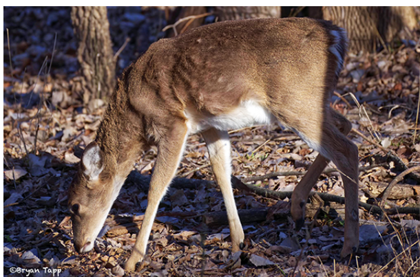
This fawn has lost it's spots and is growing it's winter coat

Come out and walk this month at Oxley! You'll be surprised at all the signs of Winter you will see. Deer have filled out with their winter coats, and fawns have lost their spots. Armadillos abound and are surprisingly easy to spot, snuffling along in the underbrush. And all the different types of sparrows! Winter is the season when this plain, everyday bird becomes something special as we see many immigrant species that we don't normally spot.