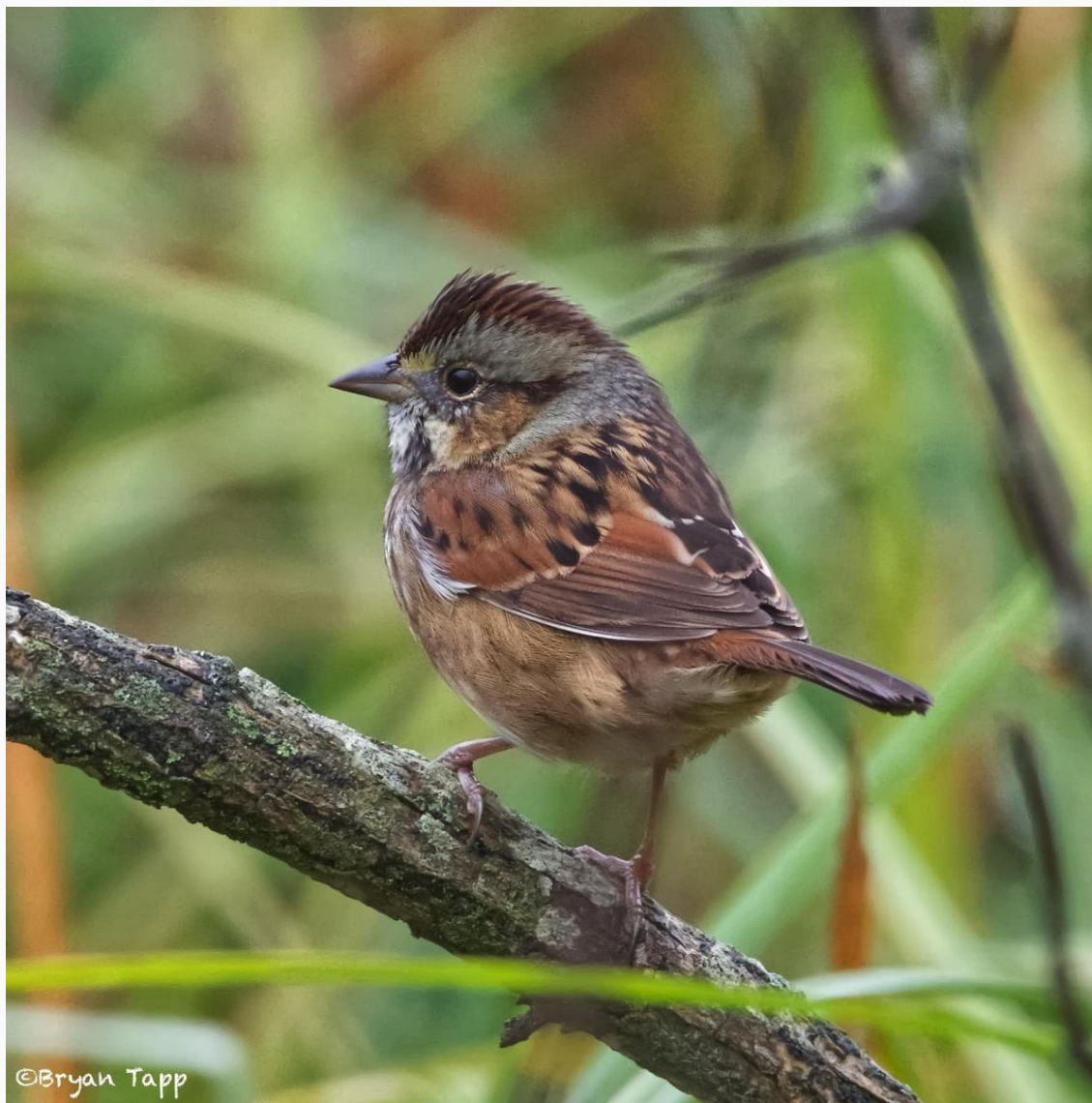
Swamp Sparrow / Bryan Tapp