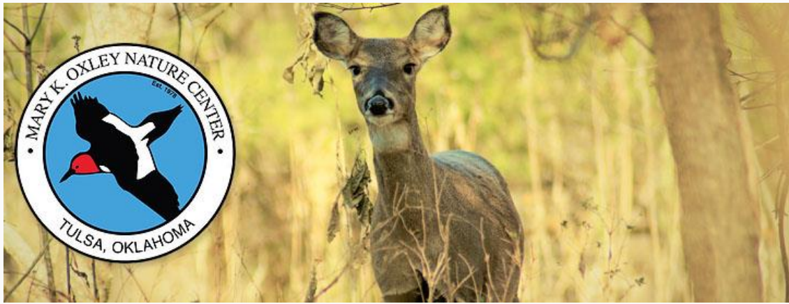
White Tail Deer

Do you have a nature lover in your family? Come to Oxley Nature Center's Gift Shop to find gifts for the holidays that will definitely please and inspire. We have an amazing assortment of nature books for children of all ages, as well as guides to mammals, birds, snakes and more that adult nature lovers will treasure and use for years to come. We also have thoughtful items like bee houses, magnifying glasses, hummingbird feeders and more! And after you are done shopping, reward your efforts and take a beautiful nature hike! We look forward to helping you select the perfect items.