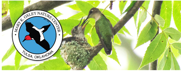
Ruby Hummingbird feeding young

I'd love to be a volunteer at Oxley Nature Center.... Have you ever thought about volunteering at Oxley and wanted more information about what it involves? On August 23, 10:00 a.m. – 12:00 p.m. we will be hosting a "Volunteer Walk and Talk". If you've ever wanted to find out more about becoming an Oxley volunteer, please join us for this informative session. Staff naturalists will go over all volunteer opportunities, from leading field trip groups, to working at the front desk, to assisting with trail maintenance. Please call 918-594-9054 or email us at oxleync@gmail.com to RSVP.