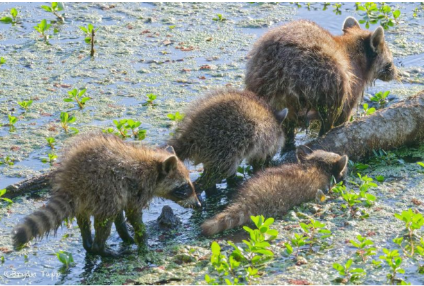
Raccoon family

Interpretive Center hours are 10-4:30PM Tuesday through Saturday, and Noon - 4:30PM on Sunday. Thursdays we are open until 8PM. After Interpretive Center hours, trails are open for hiking until 9:00 PM.