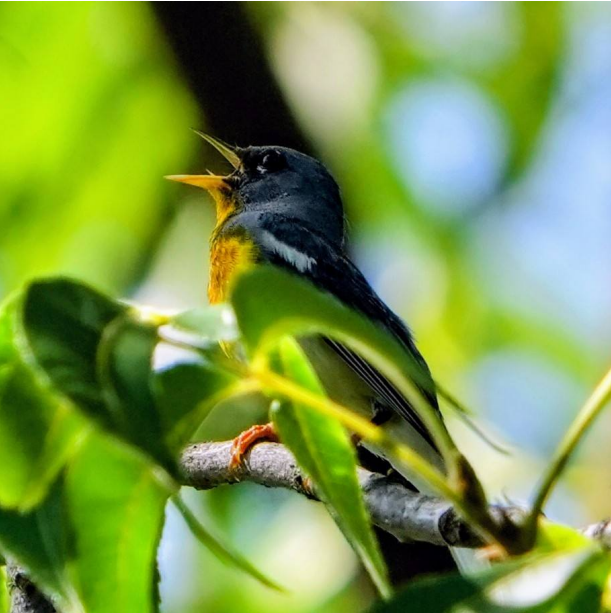
Northern Parula