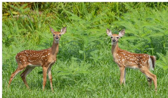
three sets of twins

On recent walks at Oxley Nature Center, visitors and staff have noticed pairs of fawns along with a single mother. What have you seen? Does it seem like there are more pairs this year than in prior years? Fewer? Have you ever wondered why this might be?