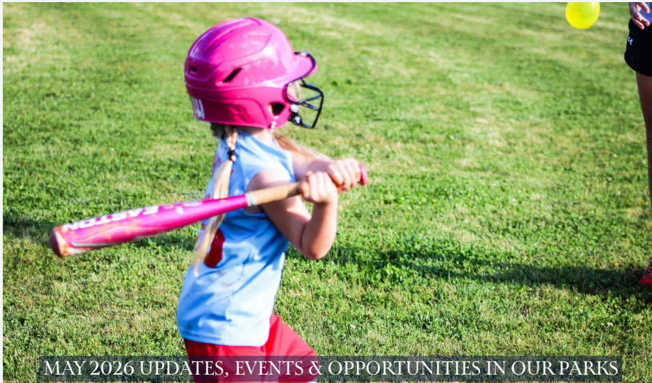
MAY 2026 UPDATES, EVENTS & OPPORTUNITIES IN OUR PARKS