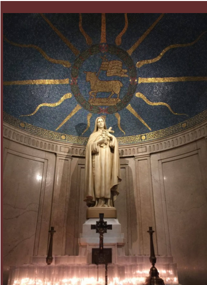
Shrine of St. Therese of Lisieux at the Basilica of St. Mary in Minneapolis