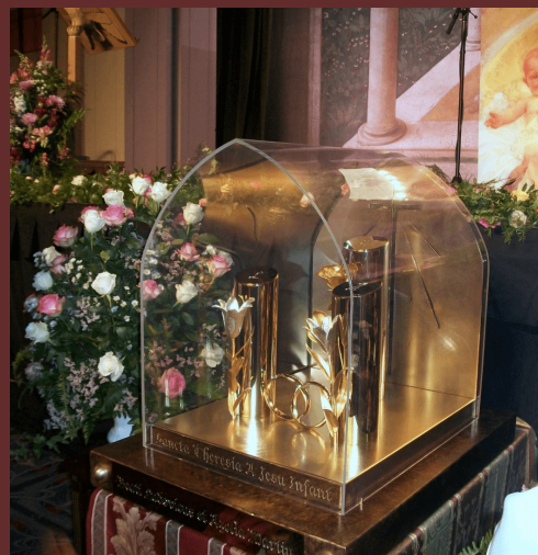
The Pilgrim Relics of St. Therese of the Child of Jesus . Includes her religious habit, rosary and other artifacts.