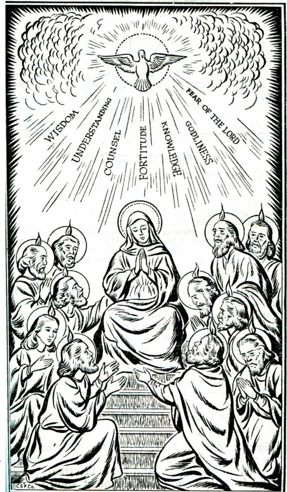
DESCENT OF THE HOLY SPIRIT