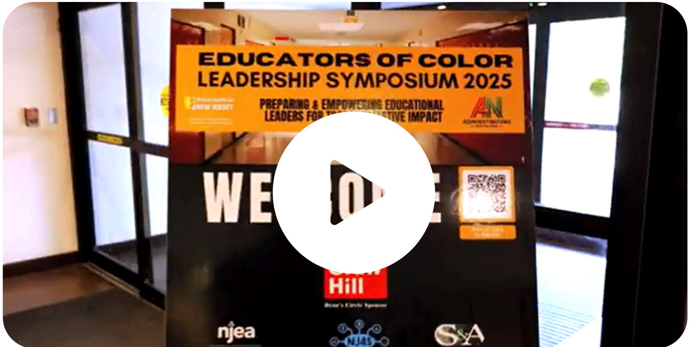
Senator Benjie E. Wimberly NJ Legislative District 35

CLICK HERE TO WATCH THE 2025 SYMPOSIUM VIDEO