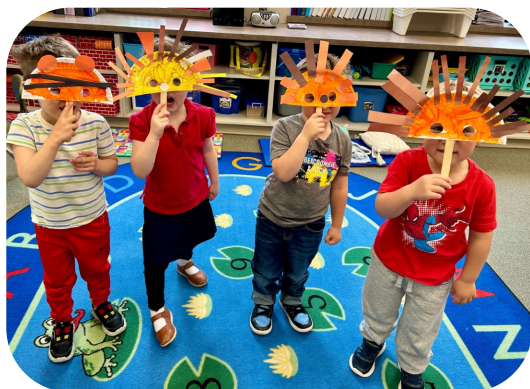
The 3K students made Zoo Animal Masks.