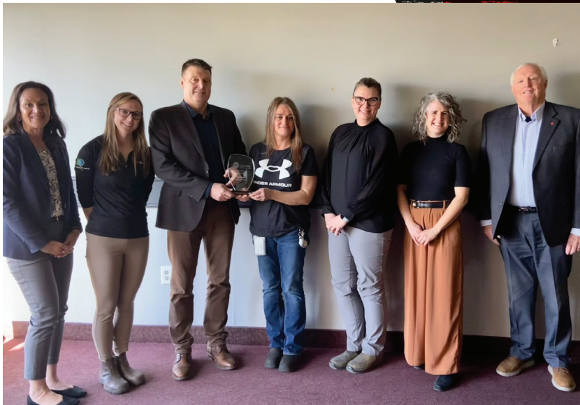
Chairs Cup – Industrial: 3M Canada, Brockville