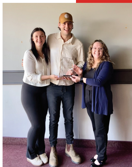
Rural Strong Award: Stoodley's Kitchen and Beverage