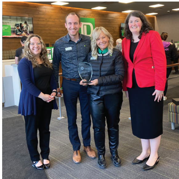
Chairs Cup – Finance: TD Bank Brockville