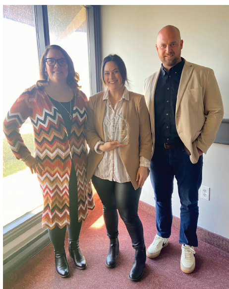
Chairs Cup – Health & Social Service: Leeds Grenville Community Family Health Team