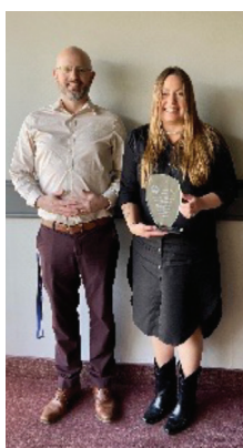
Chairs Cup – Public Service: Government of Canada Workplace Charitable Campaign