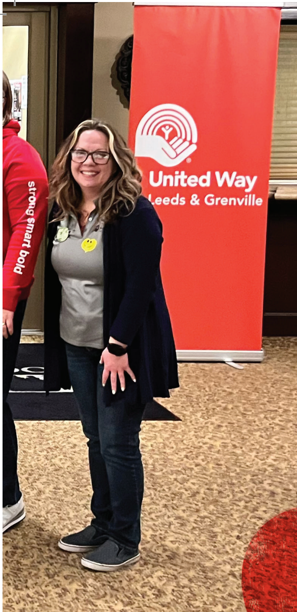
United Way Leeds & Grenville Network of Agencies celebrate World Children's Day