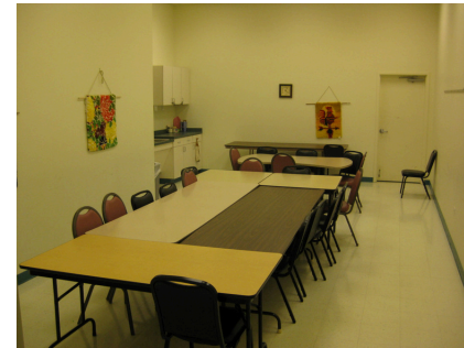
Arts & Crafts Room 470sq.ft. Max. Capacity = 25