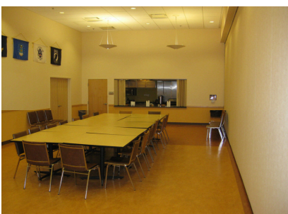
Small Assembly w/ Demo Kitchen

Theater Seating = 250 Table Seating = 175