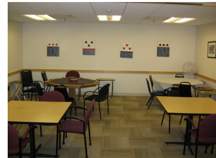
Card Room 360sq.ft. Max. Capacity = 25

Call (847)768-5944 for questions or more information about rental space availability.