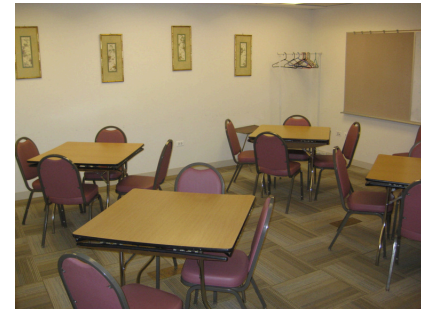
Game Room 325sq.ft. Max. Capacity=17