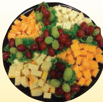
Cheese Please $3.49 per person Four different cheeses of your choice sliced or cubed.***