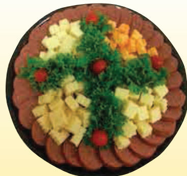
Snack Shop $3.79 per person Ring Bologna, Choice of Four Cheeses.***