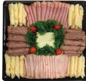
Party Pleaser $3.49 per person approx. one sandwich Ham, Turkey, Roast Beef, White American Cheese, Swiss Cheese.***