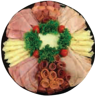
Old Tyme Favorites $2.99 per person approx. one sandwich Ham, Turkey, Sweet Lebanon or Minced Bologna, White American Cheese, Swiss Cheese.***