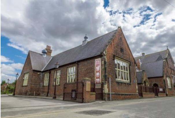
Above ~ the Wilderspin school