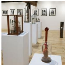
Far right The Ropery museum and near right the Ropery craft gallery.