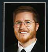
John Paul Brockman College 4 Saint Joseph College Seminary St. Francis Xavier, Brunswick