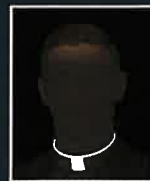
Please pray for all men who are called to the priesthood