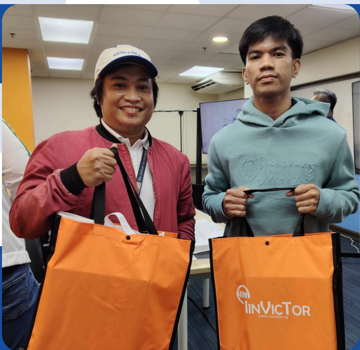
Winners of Invictor gaming set