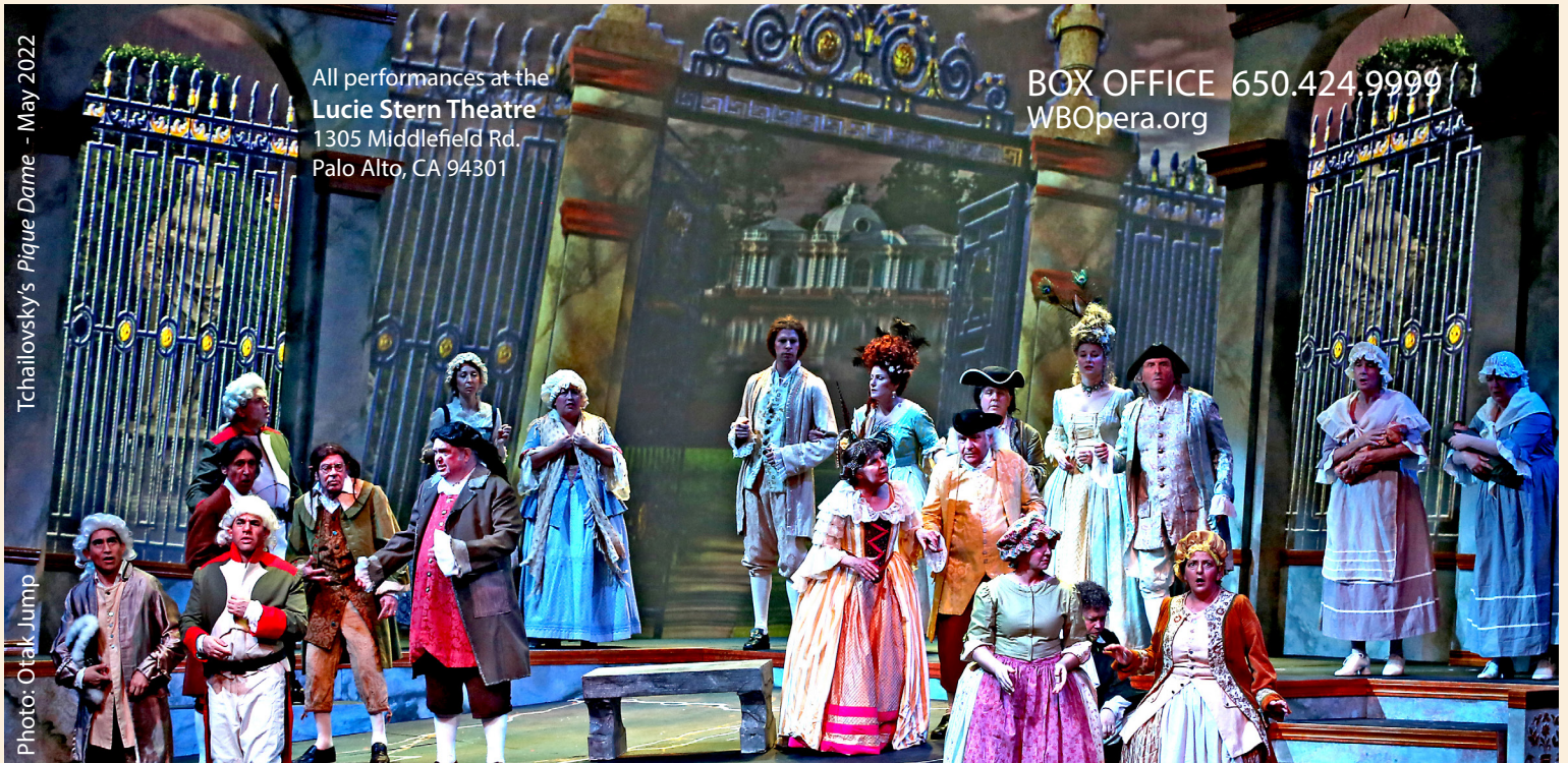
Tchailovsky's Pique Dame - May 2022