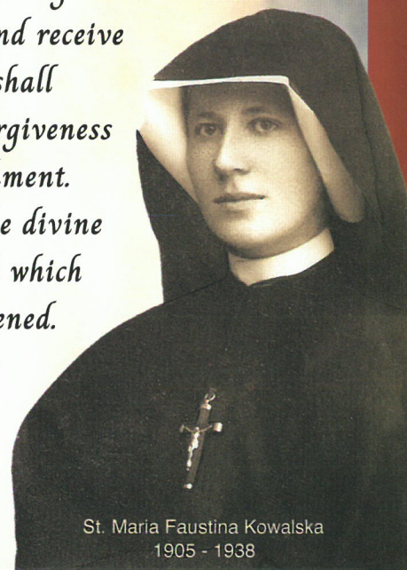
St. Maria Faustina Kowalska 1905 - 1938

“My daughter, tell the whole world about My inconceivable mercy. The soul that will go to Confession and receive Holy Communion shall obtain complete forgiveness of sins and punishment. On that day all the divine floodgates through which graces flow are opened. Let no soul fear to draw near to Me, even though its sins be as scarlet” (699).