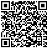
Text in English

From the beginning of his pontificate, Pope Leo has made no secret of the fact that the promise and the challenge of artificial intelligence has been on his mind. In his first encyclical (a letter from a pope containing authoritative teaching), Pope Leo addresses the church on AI's potential and considers its proper use and development in service of humanity. The full text is available at these codes: