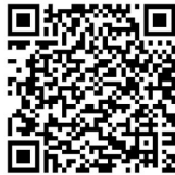
Text in Spanish