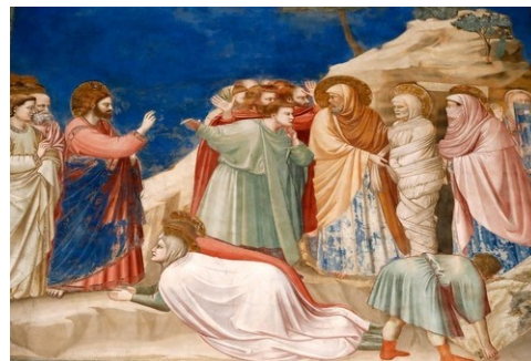
Fresco by Giotto, 1303—1305 The Scrovegni Chapel, Padua

Now many of the Jews who had come to Mary and seen what he had done began to believe in him.