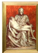
A MASS OFFERING