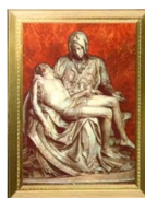
A Mass Offering

The suggested offering for weekend and Holy Day Masses is $25.00 & weekday Masses is $10.00. To schedule a Mass call the Parish Office.