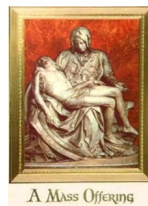
A Mass Offering

Lord, for your faithful people, life is changed, not ended. When the body of our earthly dwelling lies in death we gain an everlasting dwelling place in Heaven.