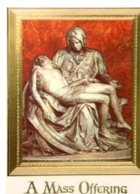
A Mass Offering