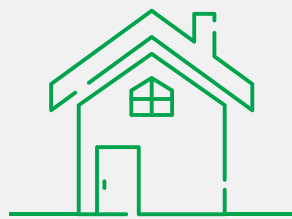
Stamp Duty thresholds returned to previous higher levels in April 2025 in England and Northern Ireland

Whether you're renting or buying, these developments could influence your plans in the months ahead. Taking time to review your position now can help you stay informed and make confident decisions.