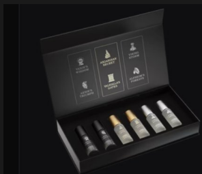
Cologne Sample Kit