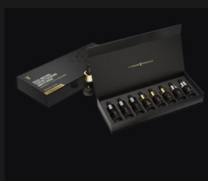
Beard Oil Scent Sampler