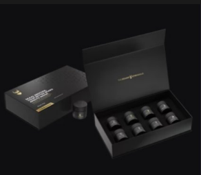
Balm Sampler Kit