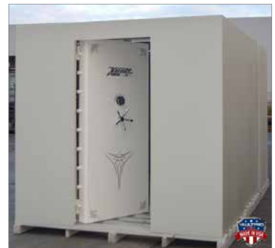
7.5' x 12' Three piece walk-in vault with 3ga. steel body, In-swing vault door.