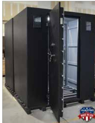
Each Walk-in Shelter is fully assembled for quality assurance.