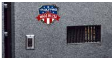
Electrical outlet and standard louvers for ventilation.