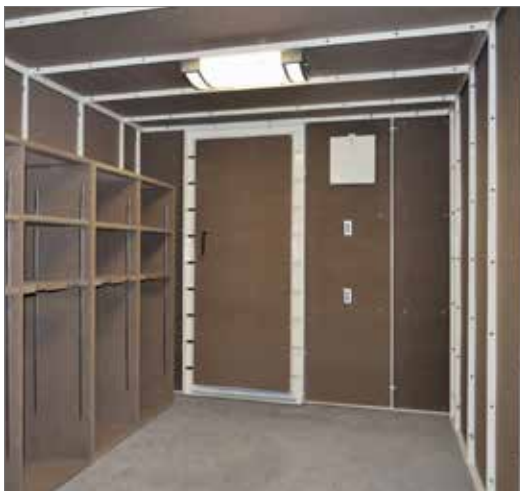
Vault Rooms can be configured with lighting, electrical outlets, shelving, ventilation, and more.