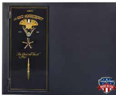
Personalize your Safe Room with Hand Painted Custom Art. Add Your Family Name or Company logo.