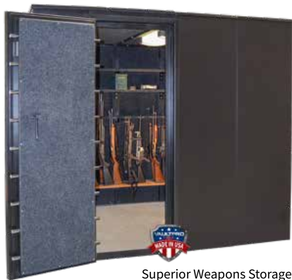
Superior Weapons Storage and Security with Quick Access.