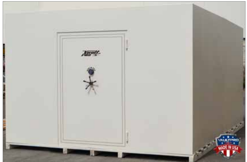
Modular Design Allows for Shelter Safe Rooms of All sizes from closet to warehouse

Vault Pro modular shelters can be made in virtually any size and configuration. Our modular design shelters are ideal for custom conversions of closets, basements and spare rooms into fully functioning storm shelter safe rooms. Custom interiors and options available to suit your individual preferences and requirements. Please call to talk with one of our tornado shelter and safe room experts. We deliver shelters factory direct to all states.