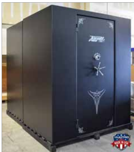
6' x 8' Large piece, two-piece shelter.