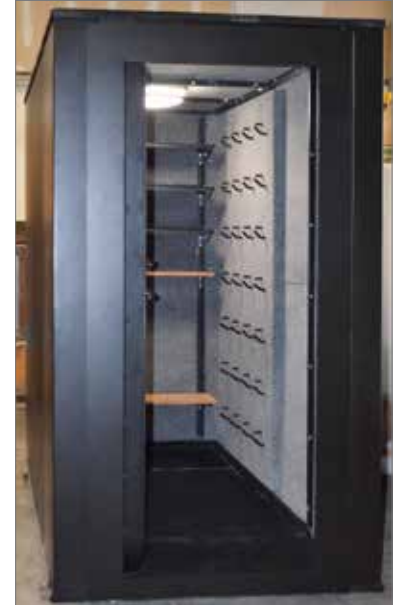
Standard or custom configure any way you want.