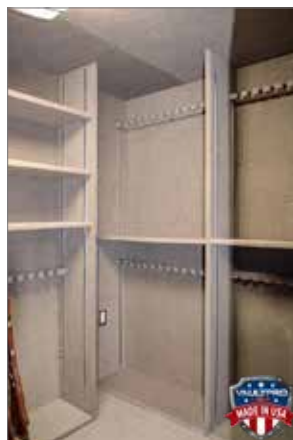
Configure your safe room any way you want.