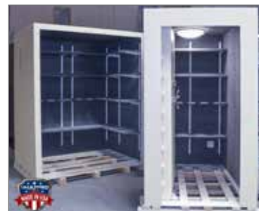
Customize anyway you want. Custom shelving, tactical walls, custom art. Create your own private walk-in vault room.