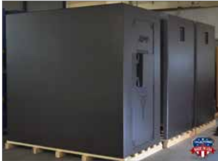
12'D x 7.5'W foot Custom Walk-in Vault Room. In-swing door with optional lock and handle cover.

Our large piece walk-in vault rooms and shelters are available in a multitude of standard sizes. We offer custom sizes and configurations.