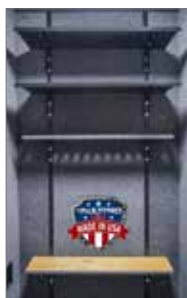
Heavy Duty Shelving, fully adjustable.

The Defender, Walk-In Vault Room and Emergency Storm Shelter Combination. This super sturdy vault room can accommodate 5-7 persons and features 7 gauge steel wall construction, two-way vertical and horizontal C-channel supports for maximum protection, combined with a fully locking Elite series vault door with internal emergency release for superior security from break-in, fire and severe weather events.