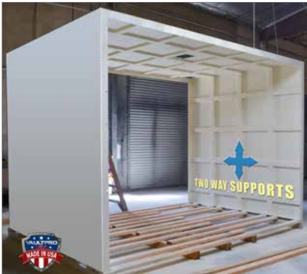
Vertical and Horizontal C-Channel Supports Provide Superior Strength

ALL SHELTERS BUILT to EXCEED FEMA 320, 361 and ICC 500 STANDARDS