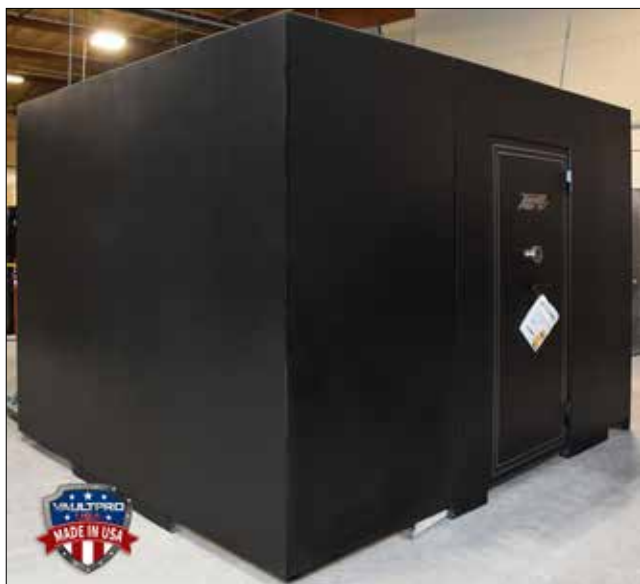
Large Two Piece Walk-In Vault Room with Heavy Duty American Steel Walls, Fully Locking Vault Door with American Made Digital Lock.