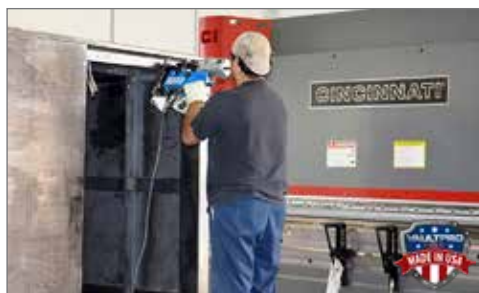
Vault Pro Safe Rooms are built with pride by skilled craftsman in America.