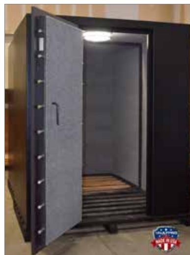
6' x 8' Large piece vault with interior lighting. Quick interior door release.