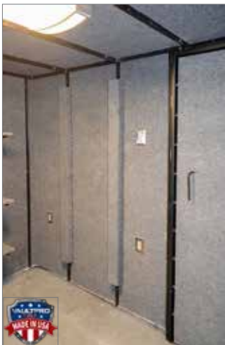
Small piece panels bolt together to form a super secure room.