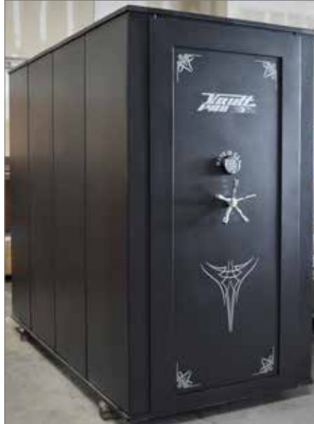
Easy assembly. Build a secure walk-in room in existing space.