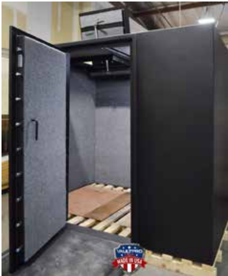
Shelter with Emergency Escape Roof Hatch

An Emergency Escape Hatch provides a secondary means of egress should the primary exit from a shelter or safe room become blocked, unusable or unavailable. Every Storm Shelter Safe Room should have an Emergency Pro Escape Hatch.