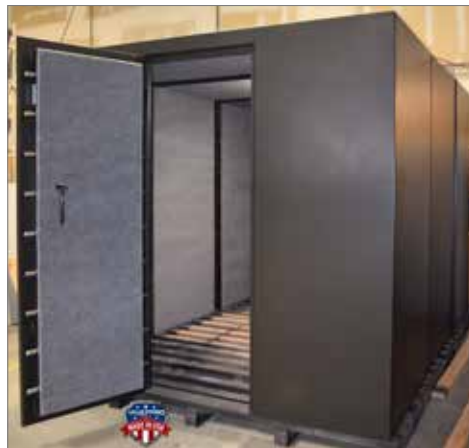
Large Piece three-piece walk-in vault room in final inspection.