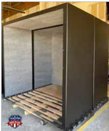
Modular Design allows for nearly any size and configuration.