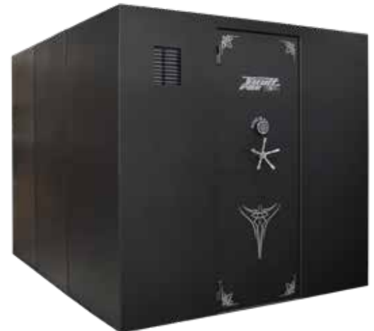
Completed 7.5'W x 10'D x 7'H Vault Room with fireproofing.