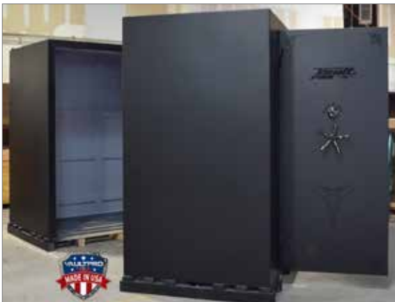
Large Piece two-piece modular walk-in vault room shelter.