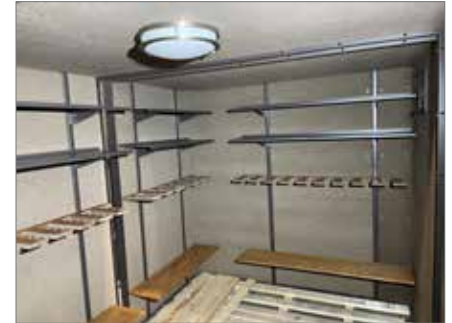
Custom adjustable shelving, gun racks, and lighting are available.