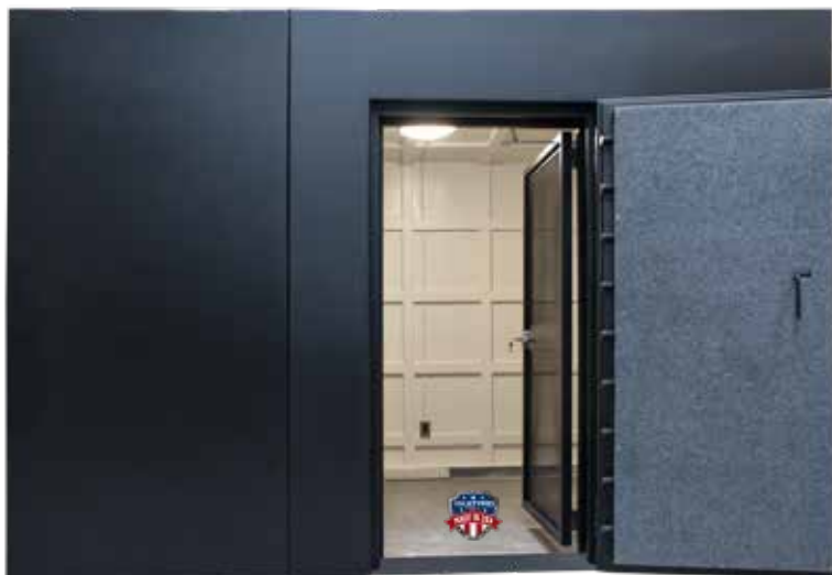
Walk in vault room secured by heavy duty Elite Series step-system vault door and optional day gate designed for commercial use. Horizontal and vertical c-channel supports provide maximum strength and resistance to severe weather events.