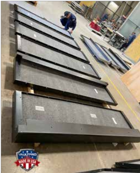
Fully modular 2'x7' panels. Available with or without fireproofing.

Truly modular 2' x 7' foot panels allow you to build a high security walk-in shelter or vault room virtually anywhere - even a closet! Exceeds FEMA 320, 361 and ICC 500 Standards for Emergency Storm Shelters.