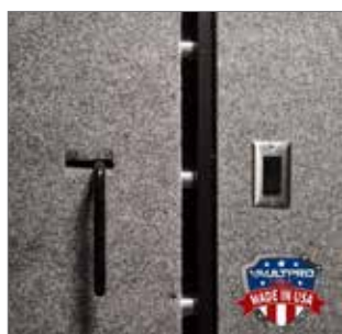
Internal release and wall switch for lighting.