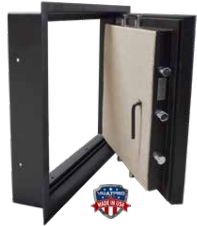
Emergency Escape Hatch with Internal Release - In or Out-swing Available

An Emergency Escape Hatch provides a secondary means of egress should the primary exit from a shelter or safe room become blocked, unusable or unavailable. Every Storm Shelter Safe Room should have an Emergency Pro Escape Hatch.