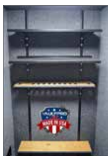
Vault Pro proprietary shelving system.