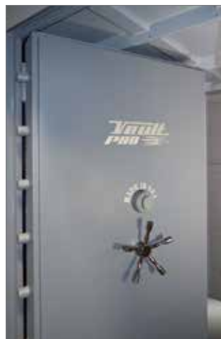
Strong Modular Design