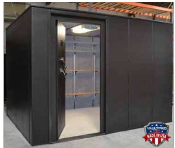
Vault Rooms any size. Vault Door can be on long side, short side, in the middle or corner.