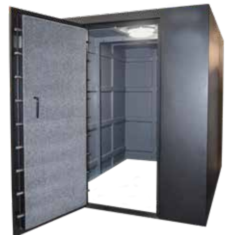
Fully assembled 6'W x 8'D x 7'H shelter without fireproofing.