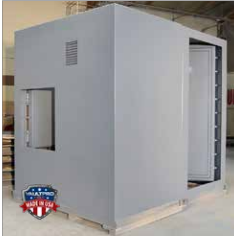
Modular Safe Room Shelter with In-swing Vault Door and Emergency Escape Hatch

Get added security with an Emergency Escape Hatch for your Storm Shelter Safe Room.