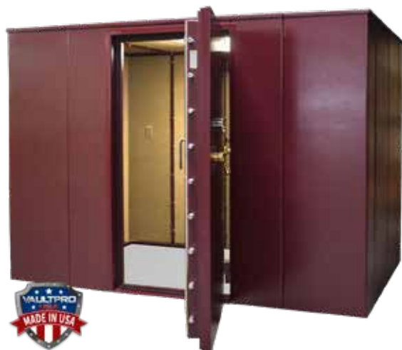
Modular Shelter in Burgundy finish. Heavy duty Step-system vault door, electrical outlets and lighting. Great Walk-In Vault Room and Shelter.

Truly Modular Shelters can be installed almost anywhere. Great for retrofit or new installations.