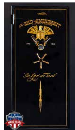
Create your own Walk-In Armory Vault . Add Tactical Wall Panels for quick weapons access.