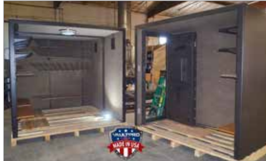
Three large piece sections combine to make a secure and fire resistant custom walk-in vault room.