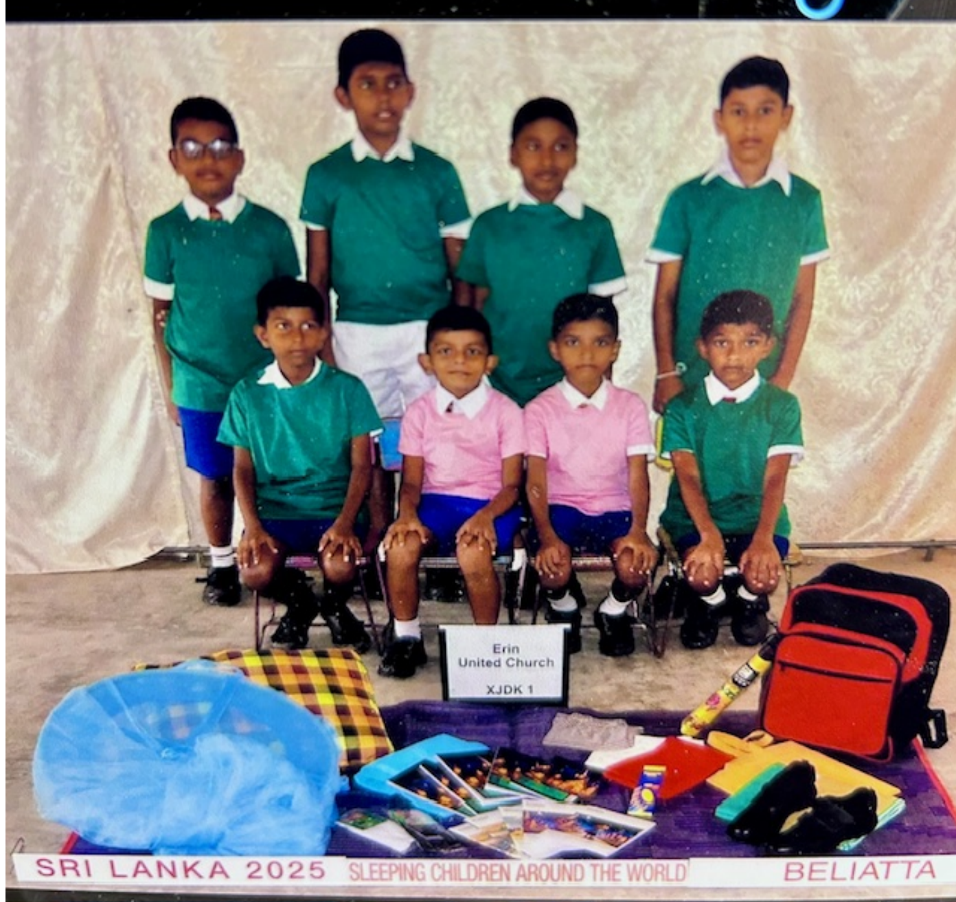
Sri Lanka 2025 Sleeping Children around the world