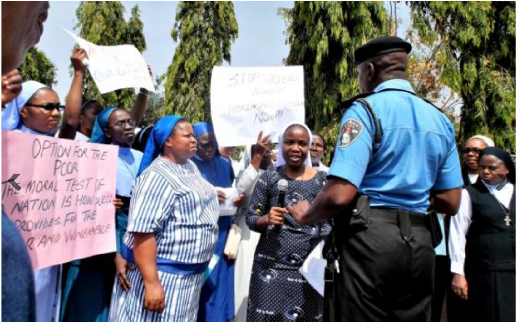
The sisters talk with police at the entrance to the National Assembly in Abuja, Nigeria, Nov. 24. (Provided photo)