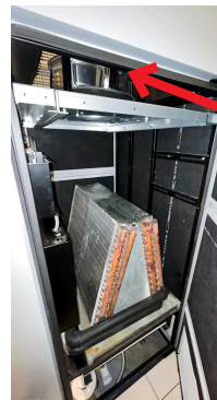
After Photos of DACD ECM Wind Wall Installed (shown is models 0734 and 2234 )