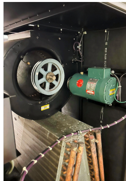
Before Photo Retrofits of DACD