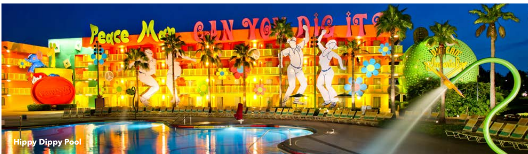
Hippy Dippy Pool