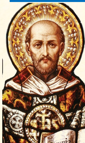
St. Ignatius Loyola Feast day July 31

Take, Lord, and receive all my liberty, my memory, my understanding and my entire will, all I have and call my own.