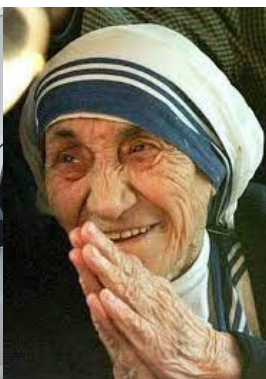
Mother Teresa Chosen HFSK Saint