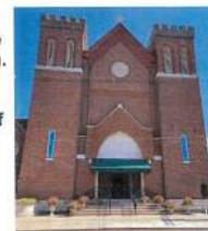
ST. PATRICK CHURCH 280 N. Grant Ave. Columbus

Join the beauty of grace in how we teach faith to Downtown Columbus, with and through Our Lady.