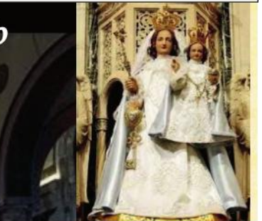
Rosary Procession with Our Lady