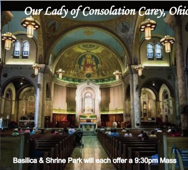
Our Lady of Consolation Carey, Ohio